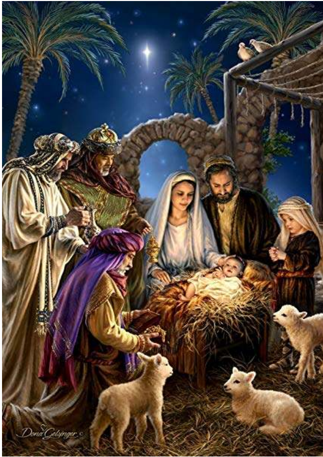
The Nativity of the Lord