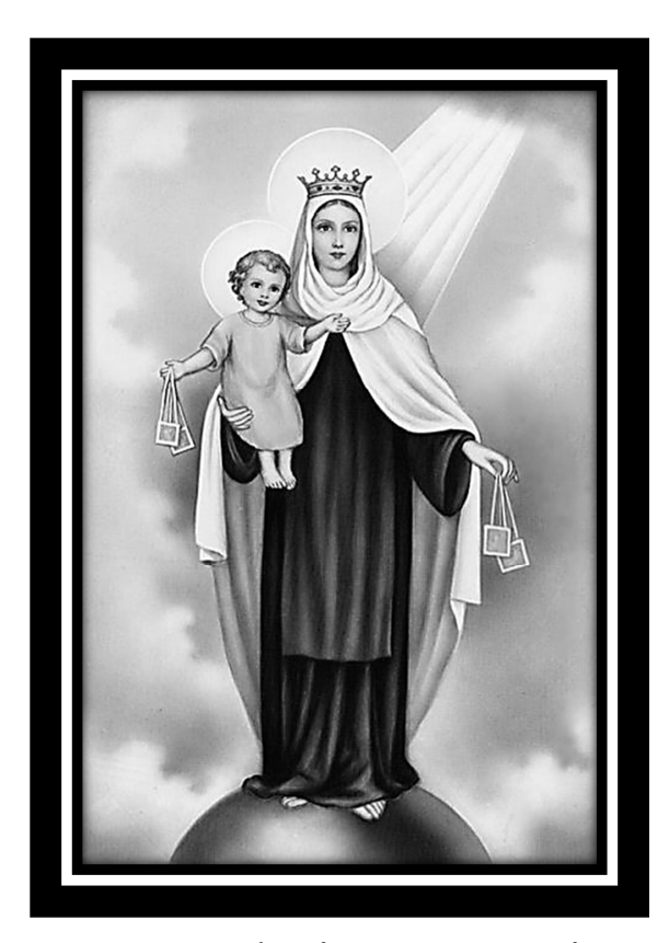
Our Lady of Mount Carmel Pray for Us 6th Sunday in Ordinary Time

120 Prospect Street, Nutley, New Jersey 07110 February 12, 2023