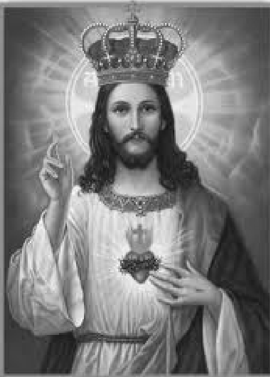
Our Lord Jesus Christ, King of the Universe