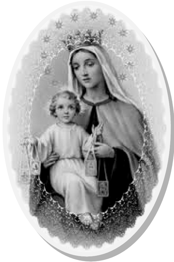
Our Lady of Mt. Carmel, Pray for Us