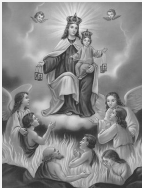
Our Lady of Mt. Carmel, Pray for Us