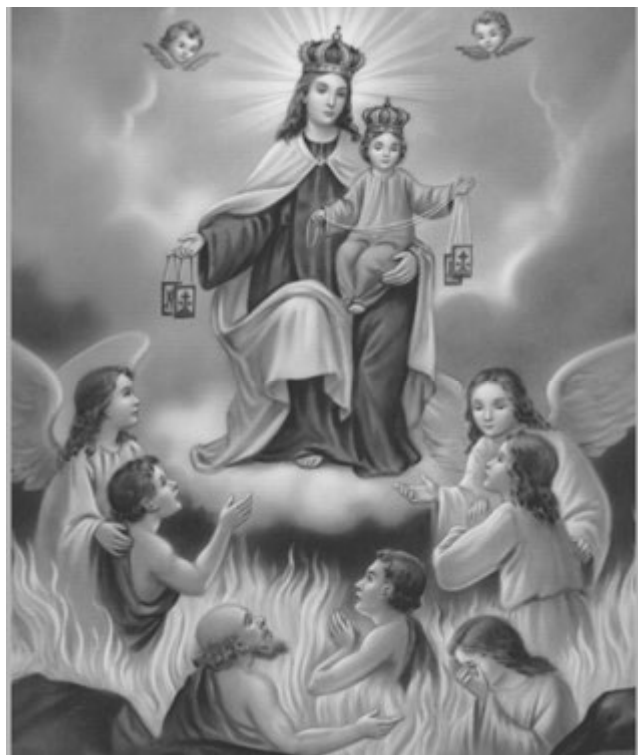
Our Lady of Mt. Carmel, Pray for Us