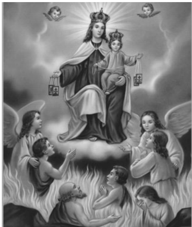
Our Lady of Mt. Carmel, Pray for Us