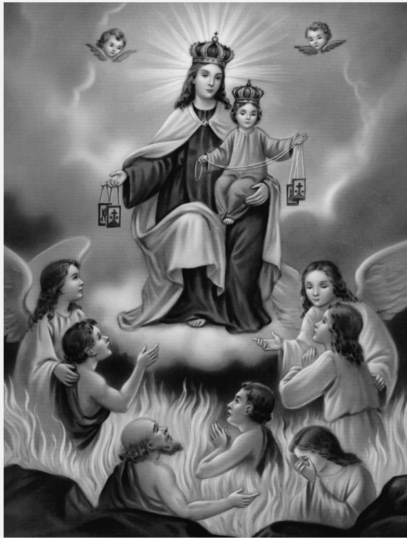
Our Lady of Mt. Carmel, Pray for Us